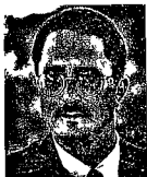
The Honourable Dr. Kenny Anthony Prime Minister

The Government of Saint Lucia joins hands with your Government in the search for PEACE, PROGRESS and PROSPERITY.